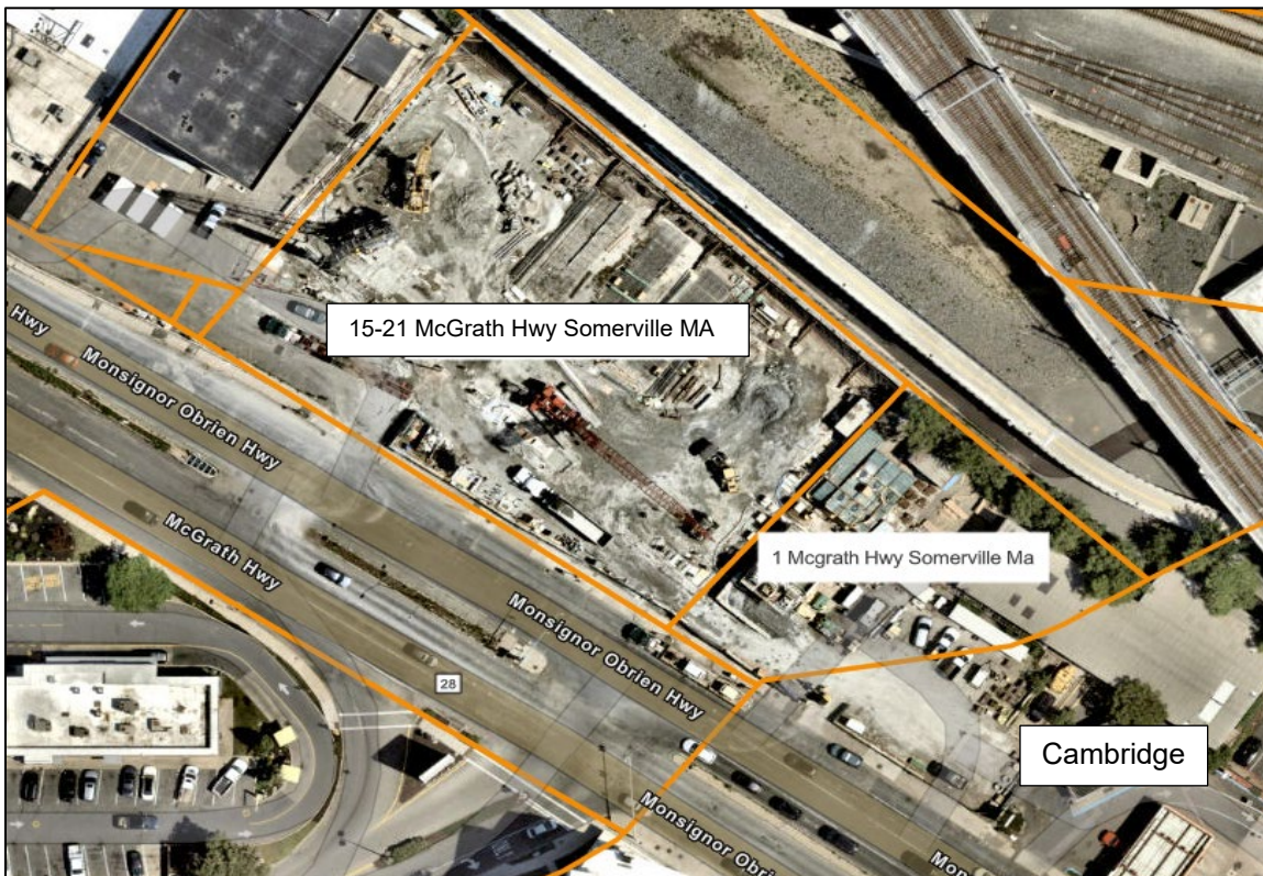
Figure 2 - Aerial image of locus, abutting property, and its proximity to the neighboring municipality.

Generally, PPZ Staff do not provide analysis or recommendations concerning the existence of actual hardship, financial or otherwise, regarding the second Hardship Variance criterion.